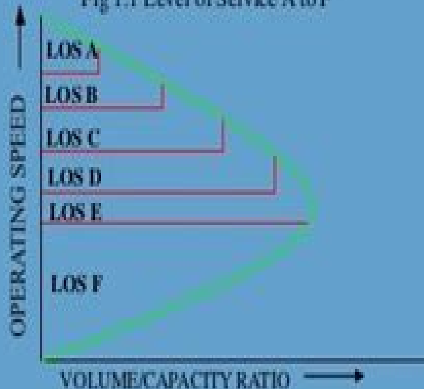
Fig 1.1 Level of Service A to F

Level of service (LOS) is a qualitative measure used to relate the quality of traffic service . LOS is used to analyze highways by categorizing traffic flow and assigning quality levels of traffic based on performance measure like speed, density, delay etc.