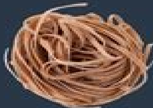
WHEAT PASTA 22g