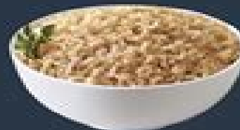
BROWN RICE 20g