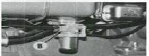
Fig. 11—View of fuel filter and air bleed screw (B).