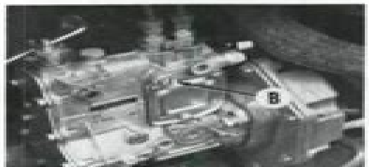
Fig. 12—View showing location of injection pump bleed screw (B).

27A. BLEEDING. To air-bleed fuel system, open fuel valve and fuel filter bleed screw (B—Fig. 11). Allow fuel to flow until air bubbles disappear and fuel is clear. Close fuel filter bleed screw while fuel is flowing; open injection pump bleed screw (B—Fig. 12)