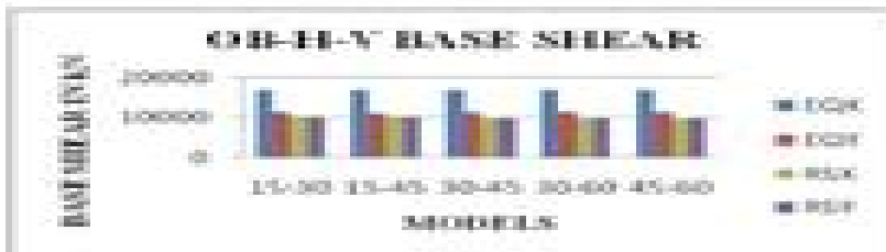
Graph 3.1: Double OB-H-V Base shear in kN