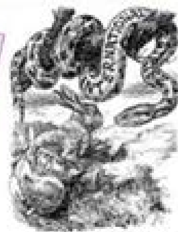
The cartoon says, 'My offensive equipment being practically nil, I depend for me to overpower him with the power of my pen.'