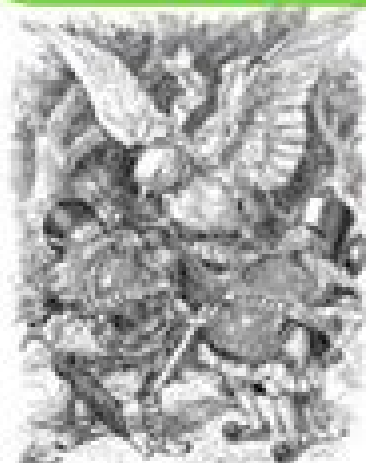
Illustration for Source D.