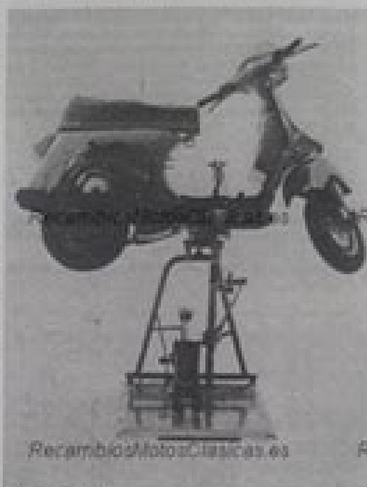
Motor del chasis.

Realizar el vaciado del aceite del cambio en un recipiente limpio a través de su orificio de vaciado (1.4.3). Realizar una placa según las indicaciones realizadas en la figura A para su aplicación al soporte motor T. 8025095 con el tornillo Z y seguidamente acoplar el motor.