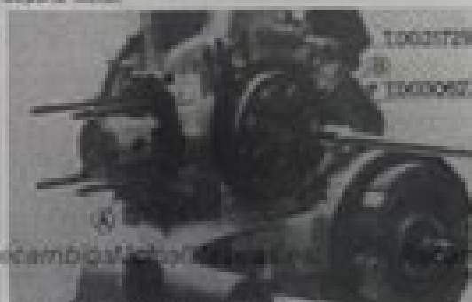
Desmontaje grupo y grupo embrague.