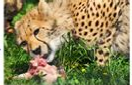
The cheetahs happily eating food