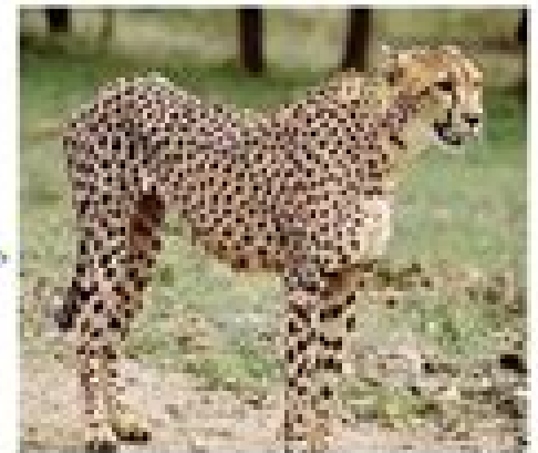
Cheetah fully grown!

Then the whole cycle starts over again! (but only if the cheetah fully grown is female)