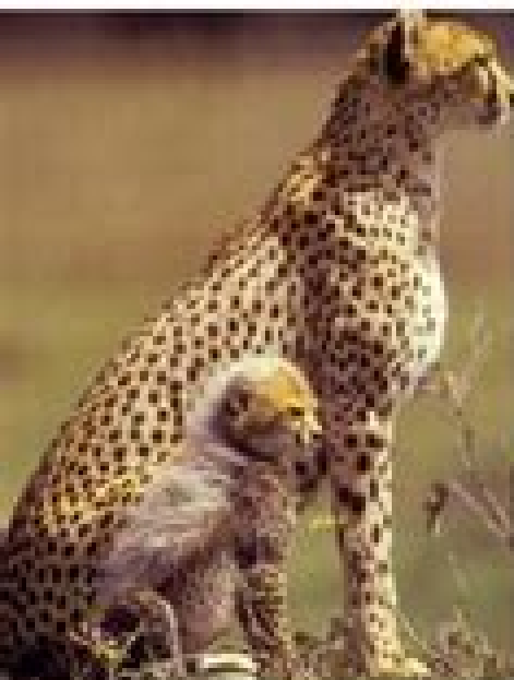
Mother cheetah teaching baby how to survive