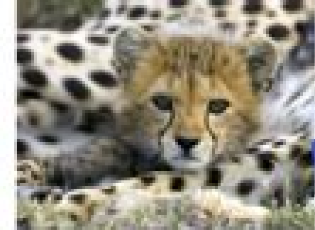
A cute baby cheetah is born!