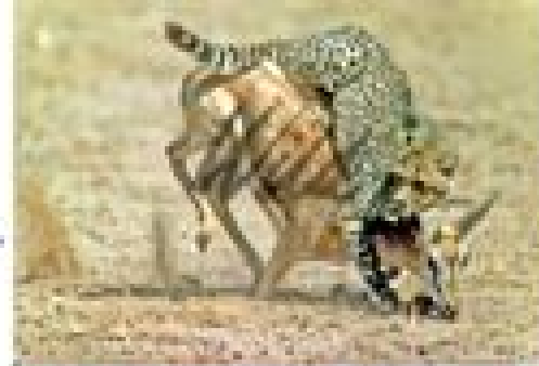
The mother cheetah brings food for the baby