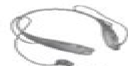
LG HBS-700 Bluetooth® Stereo Headset