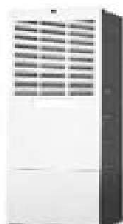
Front Return with Coil Box