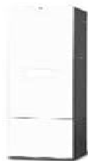
Top Return with Coil Box