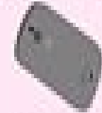
2. Attach the battery cover