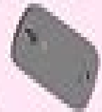
2. Attach the battery cover

Step 1: Insert the battery into the battery cover. Please refer to the manual for the guide. Step 2: Attach the battery cover.