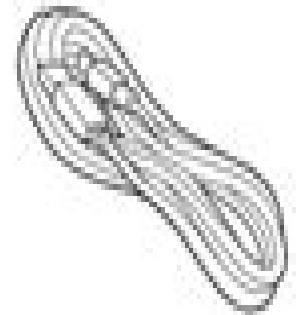
USB Type C™ Charging Cable