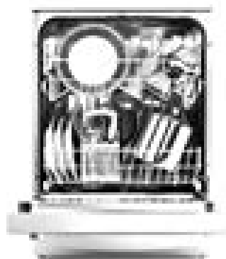
DISHWASHER CAPACITY - 12 PLACE SETTINGS