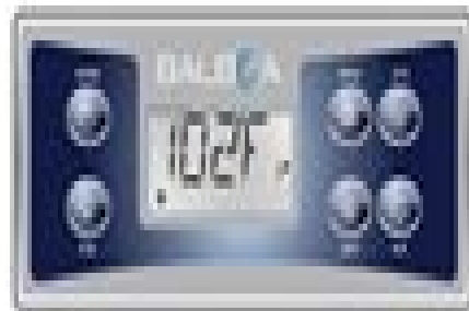
Balboa VL260 / VL401