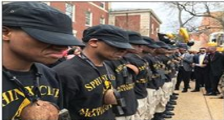
New member presentation of Alpha Phi Alpha Fraternity, Inc., Beta Chapter, on Friday, April 7.