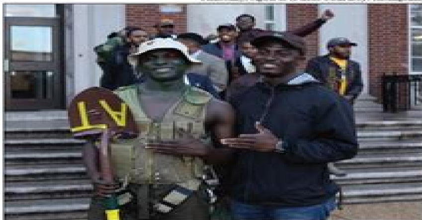
New member presentation of Iota Phi Theta Fraternity, Inc., Alpha Tau Chapter, on Thursday, April 6.