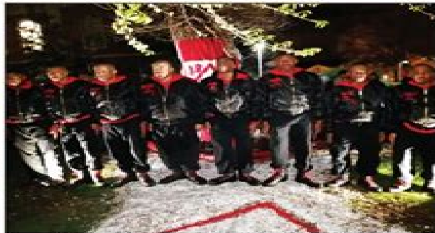
New member presentation of Kappa Alpha Psi Fraternity, Inc., Xi Chapter, on Thursday, April 6.