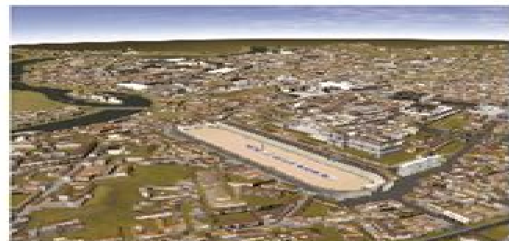
Figure 1. Rome Reborn 1.0

Rome Reborn 1.0 contains about 7,000 buildings, which for the purposes of the model were divided into Class I and Class II categories. The Class I category is for landmarks and other features that are well-known and for which there is documentary information about their location, function, size, and appearance. Class II covers buildings and features whose existence is documented but whose actual location, appearance, and size are not known (e.g., apartment buildings, single family dwellings, warehouses, and shops). Approximately 250 buildings in the model are marked as Class I, and the remainder belong to Class II.