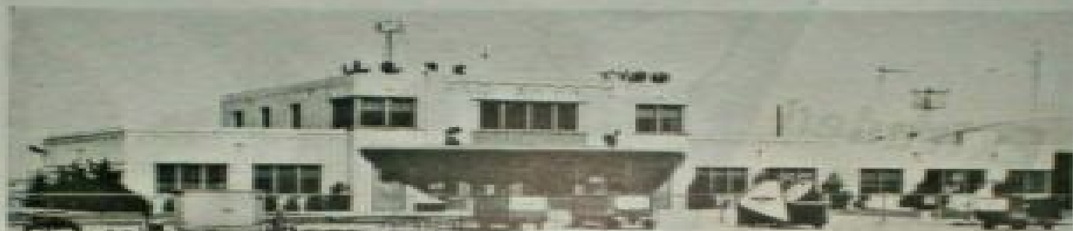
Airline Terminal Building, which houses operations, ticketing, and reservation offices for Braniff Airways, Inc., Delta, Inc., and Transcontinental & Western Air, Inc.; C. A. R. Communications System; U. S. Weather Bureau Station; a Coffee Shop and Dining Room.

F OLKS who fly the Southwest will tell you that for courteous, personal service and friendly good-will, there's no place else out West. English Field in Amarillo!