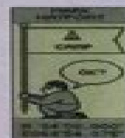
Mark waypoint page