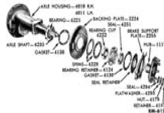
Fig. 34—Backing Plate and Hub, Disassembled

Place the axle shaft assembly on a bench, and remove the lock ring that secures the axle shaft nut. Remove the axle shaft nut, flat washer, and seal. Remove the cap screws and nuts that secure the differential gear case to the axle shaft assembly. Separate the two halves. If necessary, use a hammer to tap the two halves apart. Remove the differential spider, together with the differential pinions and thrust washers, from the differential gear case (fig. 35). Remove the differential side gears and thrust washers.