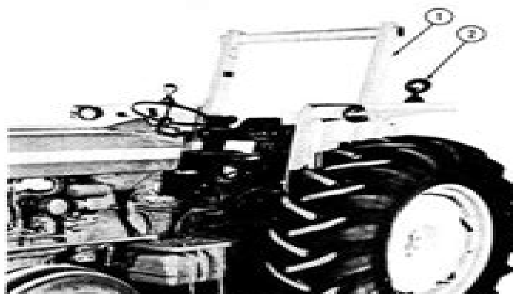
Figure 2 Two-Post Roll Over Protective Structure (ROPS)

All tractors equipped with a ROPS or cab are also equipped with a seat belt which, when used by the operator, maximizes the protection offered by the ROPS. ALWAYS use your seat belt when the ROPS is installed—seat belts save lives when they are used. Do not use your seat belt when the ROPS is not installed on the tractor.