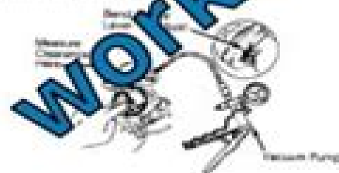
Fig. 130 Adjusting Choke Pull-Off Damper

Apply about 10 psi. of compressed air to the choke pull-off damper. Lightly push down choke lever. Measure clearance between top of choke pull-off damper and top of choke lever. See Fig. 130. If clearance is not .001-.002 in. (0.025-0.051 mm), turn damper in or out as necessary.