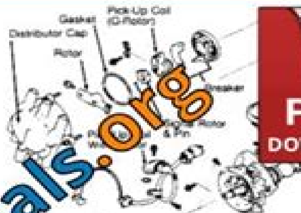
Fig. 131 Exploded View of Distributor (Mazda)

Set dam. valve up to second highest step. Measure clearance between pickup assembly rotor and distributor body. See Fig. 131. Clearance is .001-.002 in. (0.025-0.051 mm). Rotate dam. valve adjusting screw as necessary.