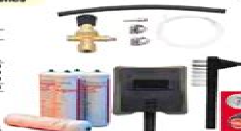
Gas Bottles are Supplied Separately