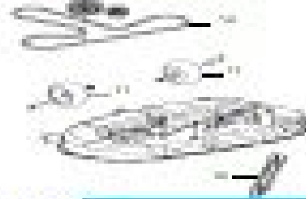
Deck B/N _____