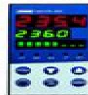
JUMO DICON 400 Type 703575/1...