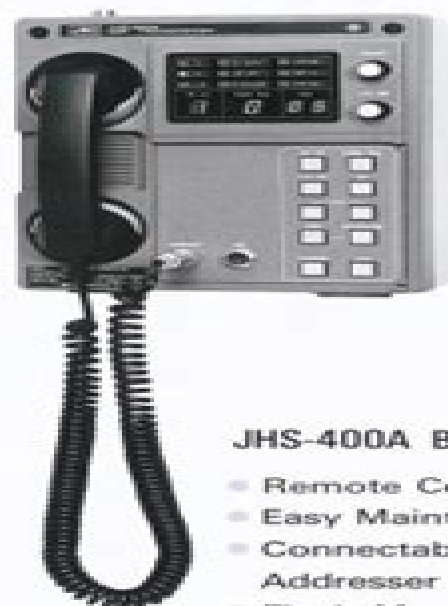
JHS-400A BASE STATION