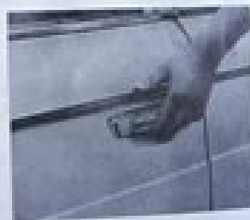
Fig. 36 Door handle