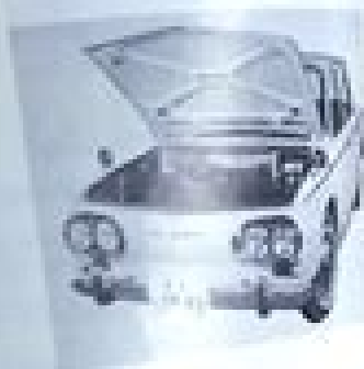
Fig. 32 Front bonnet

Press the bonnet gently until it is locked.