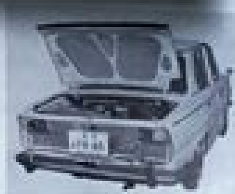
Fig. 34 Rear bonnet