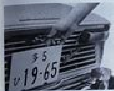
Fig. 35 Locking the rear bonnet