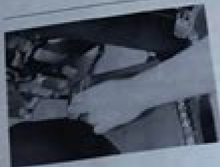
Fig. 31 Releasing handle and safety lock