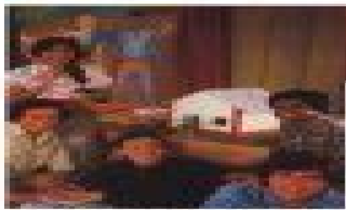
... .. ... ..