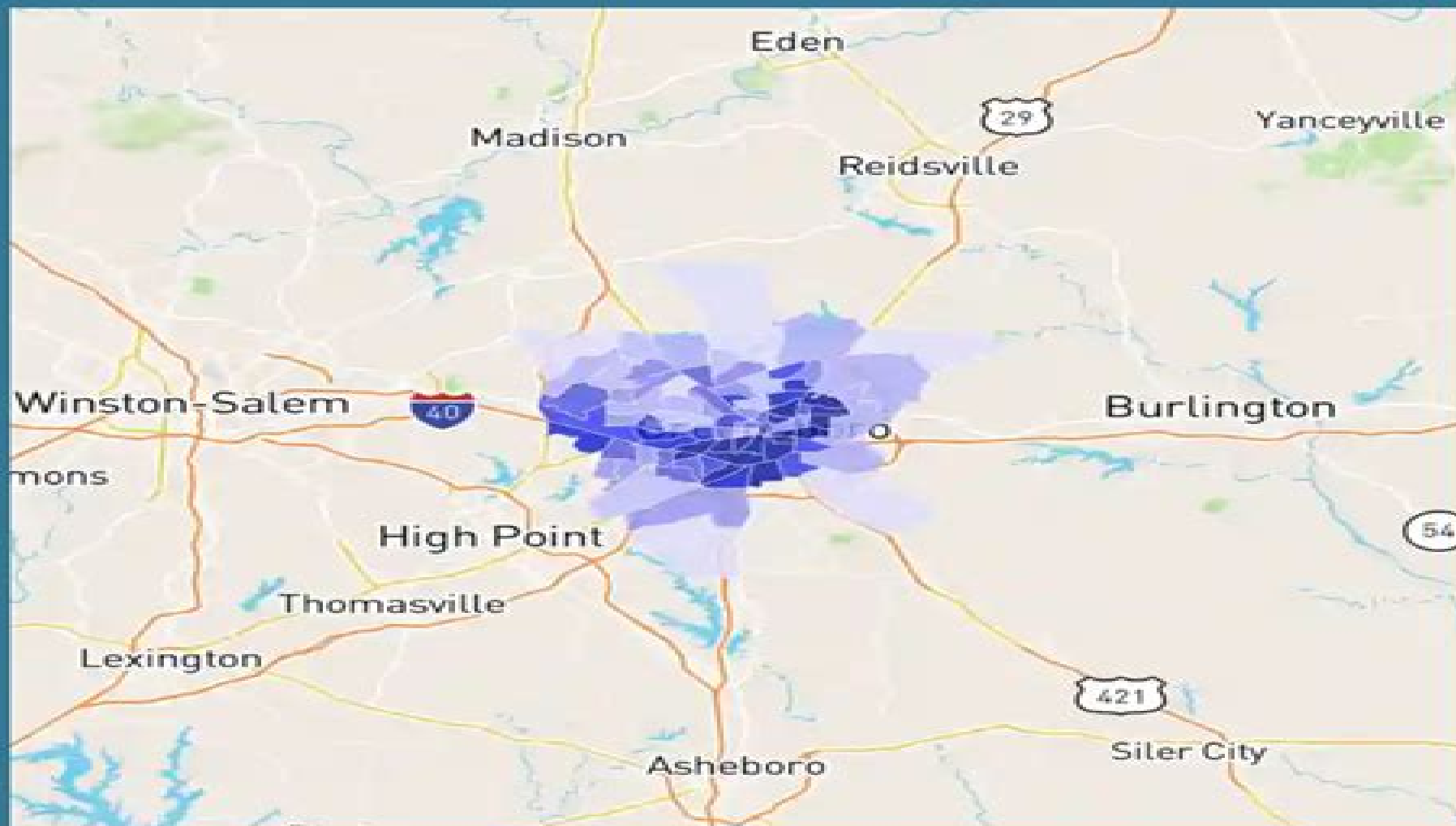
Greensboro, NC Crime Map By Neighborhood