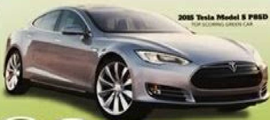
2015 Tesla Model S P85D TOP SCORING GREEN CAR

PRODUCED BY THE AUTOMOTIVE CLUB OF AMERICA'S CARPENTRY & AUTOMOTIVE RESEARCH CENTER