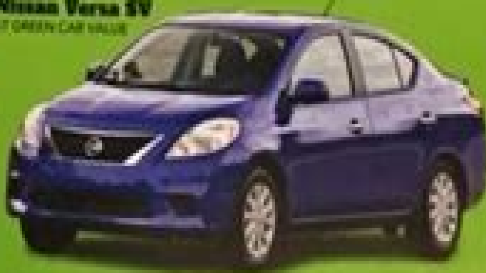
2014 Nissan Versa SV BEST GREEN CAR VALUE