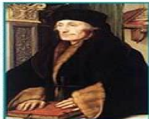
Erasmus of Rotterdam (1523) by Hans Holbein the Younger

Erasmus was a close friend of Thomas More , an English humanist best known for writing Utopia , in which he described a fictional perfect society. This text typified the Northern Renaissance because it criticized prevailing social norms, such as religious intolerance and capital punishment for small offenses like theft.