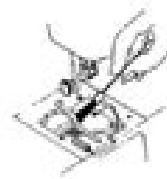
Thoroughly clean with a brush.