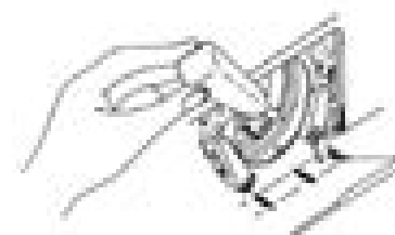
Place a drop of oil in the hook case.