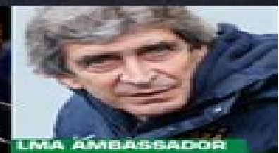
LMA AMBASSADOR MANUEL PELLEGRINI Deadly transitions