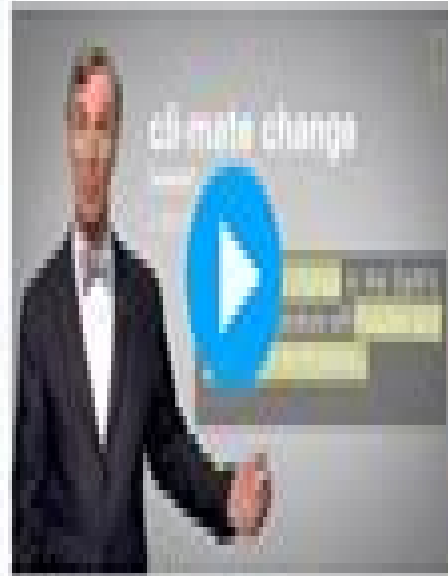
All About Climate Change