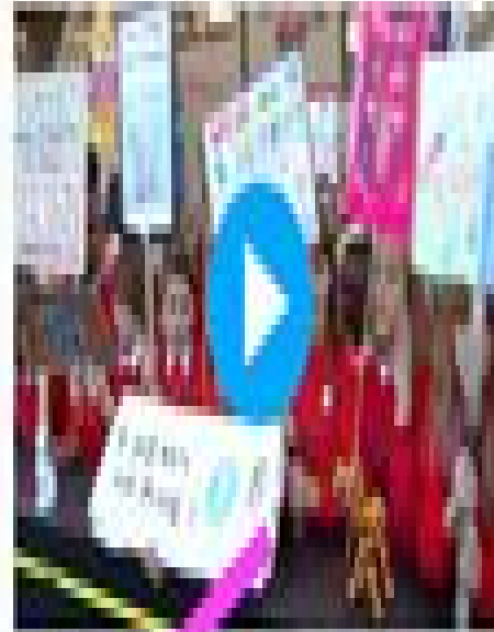
Marching for the Planet