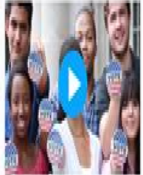
The Fight for Voting Rights