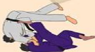
TOMOE NAGE (巴投)