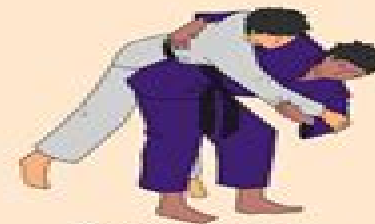
Ō GOSHI (大腰)