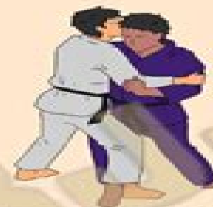
KOUCHI GARI (小内刈)