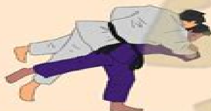
HARAI GOSHI (払腰)