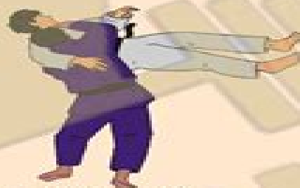
USHIRO GOSHI (後腰)