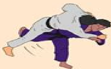
UCHI MATA (内股)