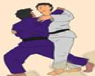
ŌUCHI GARI (大内刈)