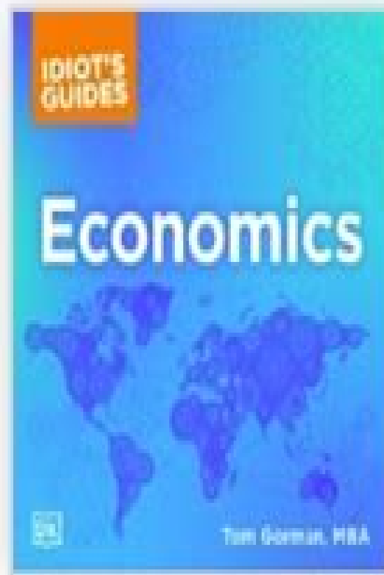
Idiot's Guides: Economics