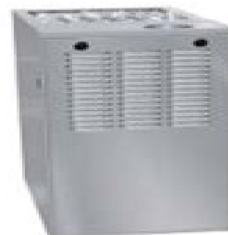
Illustrations and photographs are only representative. Some product models may vary.