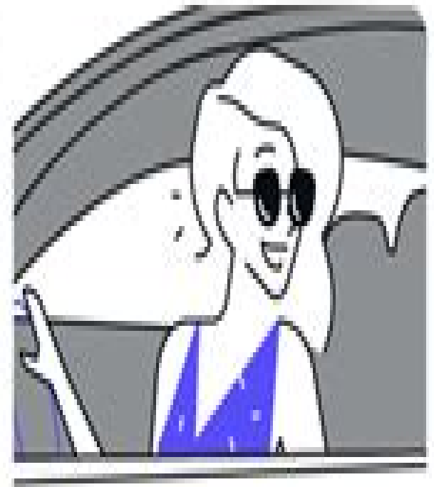
Coast is clear