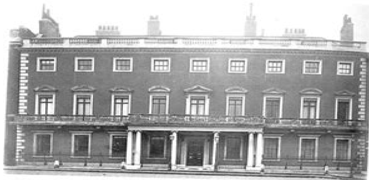
49 Norfolk House, St James's Square. The dull facade of the 1730s was dressed together nearly a century later by the imposition of columns and a balcony. Otherwise this nine-bay facade was not unlike its contemporary in South Audley Street, built with stone dressings, the left-hand four windows in the state rooms given the extra importance of pediments.