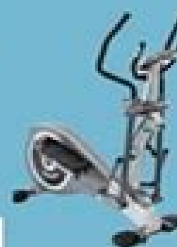
EC-1330 18- 22 inch