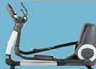
EC-1450 20-24 inch