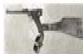
THE NEW GUN