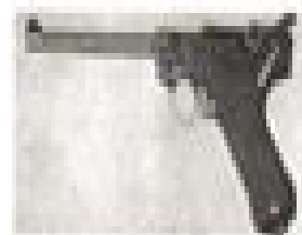
THE NEW GUN