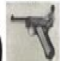
THE NEW GUN