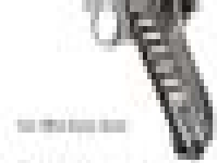
THE NEW GUN