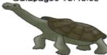
5 Galapagos Tortoise