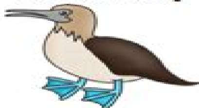
4 Blue-footed Booby