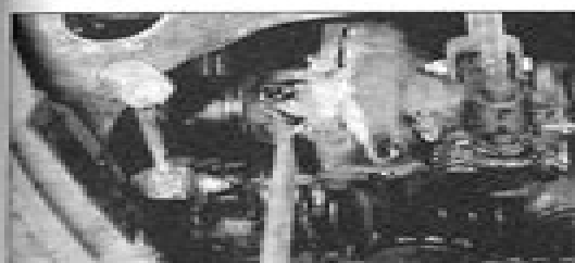
8.9 Using a cranked bar to release the offset sphere joint from the differential