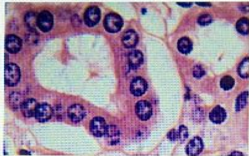
B) Epithelial Tissue Type: _____