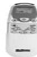
Wireless Remote Control (Standard)