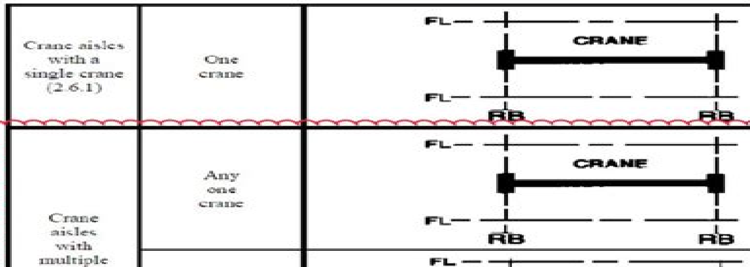
Table 2.6: Runway Beams and Suspens

Minimum distance between adjacent end truck wheel is 1000mm (see below)