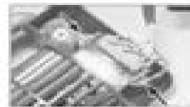
2-12: Radiator assembly (from top view of the radiator)