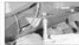
2-13: Radiator assembly (from side view of the radiator)