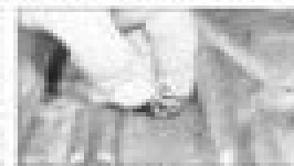
2-10: Radiator assembly (from side view of the radiator)