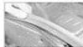
2-9: Radiator assembly (from top view of the radiator)

2-6: Radiator assembly (from top view of the radiator) 2-7: Radiator assembly (from side view of the radiator) 2-8: Radiator assembly (from front view of the radiator)