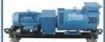
DVDF Motor Generator Set