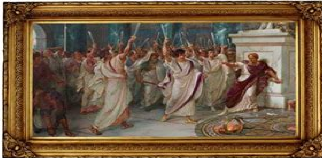
Sullivan, William Holmes; 'Julius Caesar', Act III, Scene I, the Assassination, circa 1850

Color Palette: Look at Caesar's trabea (cloak). What do you notice? What might the color symbolize? Beyond the color of his clothing, look at the overall color scheme of the painting. Are the colors vibrant, muted, or a mix? What atmosphere does this create, and how does it enhance the portrayal of the scene?