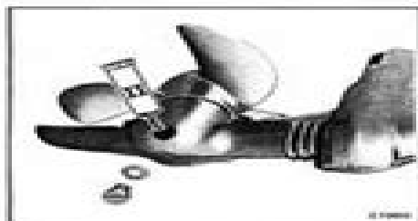
Figure 2-3. Gearcase Lubrication