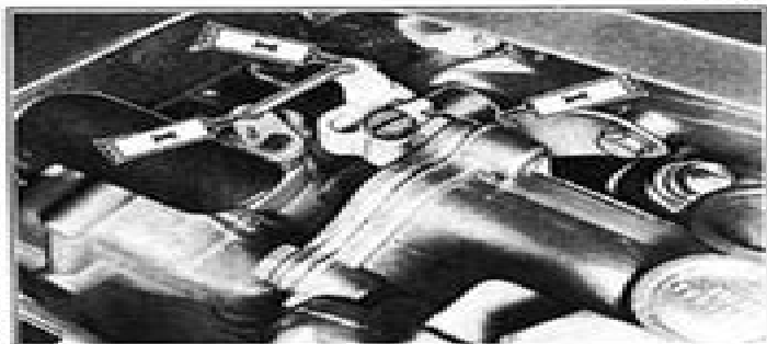
Figure 2-2. Throttle Cam and Carburetor Linkage Lubrication