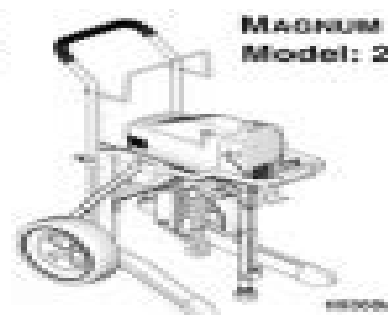
MAGNUM ProX9 Model: 261820