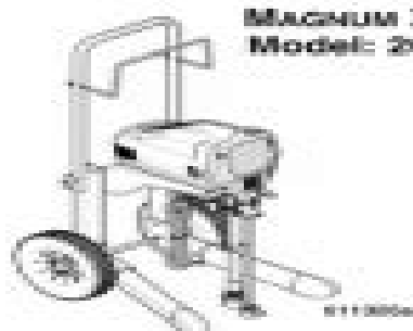
MAGNUM X7 Model: 262805