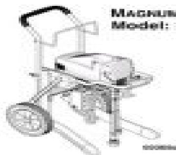
MAGNUM ProX7 Model: 261815