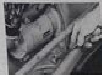
Setting timing hole bottom plug

on of #1 cylinder. After compression is felt, turn slowly with crank until gas tank hole is indicated by bottom "G.C." on flywheel. It is aligned with piston in timing hole.